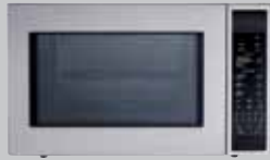
24" CONVECTION MICROWAVE OVEN