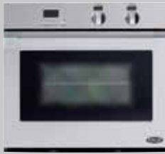
30" SINGLE WALL OVEN